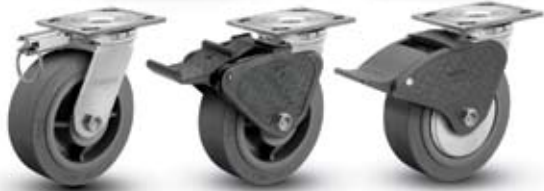
Swivel Lock ("L")