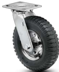
8-W81-940-1PC (shown in photo)