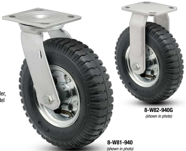
8-W82-940G (shown in photo)