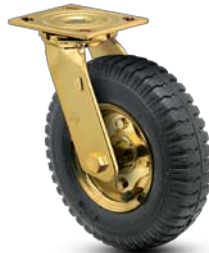
8-W81-940-GSPB (shown in photo)